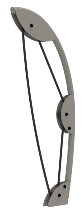
POSITION AND TRAINING ZONE:

Trainingzone = 10,4m^2/111,9 \text{ ft}^2